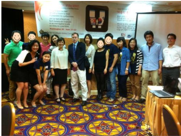
With Professors (Day 1)