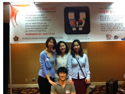
Participants From Chicago