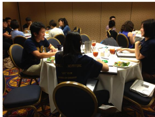
Environment & Energy group

The success of PSAs was entirely dependent upon the active participation of the conference attendees. Thanks to the attendees’ energy and enthusiasm for the conference, the organizers were able to witness the participants, despite their many differences, truly come together and make the PSA sessions a meaningful experience. The only way to explain this unity seemed to be every participant’s shared belief and love for the Korean peninsula. In the end, participants not only came up with great solutions for their given problems but also learned from each other’s personal stories and ideas. For example, a non-Korean American participant said that during the PSA session, he came to learn that the “know-it-all” mentality when aiding under-developed countries could actually be harmful. This was an example of a direct positive impact of the PSAs.