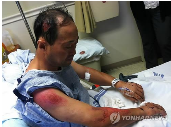
06.13.2013 Yonhap News