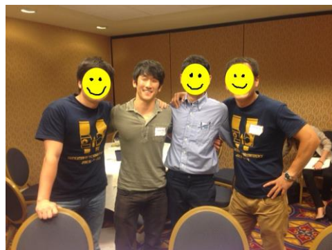
Brothers from South and North Korea ☺

Throughout this two-day event, a total of forty-three participants attended the conference. Forty-one attendees were present to listen to the guest speakers on Friday, June 21st; thirty-two participants attended the conference to partake in the program on Saturday, June 22nd. Thirty people attended the conference both days. While the majority of the participants came from the Washington DC metropolitan area, about a quarter of the participants had flown or driven from out-of-state areas to attend the event. The demographics of forty-three participants were: nineteen South Koreans, ten North Koreans (defectors), nine Korean Americans and five non-Korean Americans. Over a quarter of participants had no past experience of interacting with other demographic groups, especially with North Korean defectors.